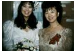
Donna Lee - March 03, 2015 at 12:13 AM

“ 1 file added to the album Memories Album