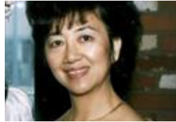
Donna - March 03, 2015 at 01:30 AM

“ 1 file added to the album Memories Album