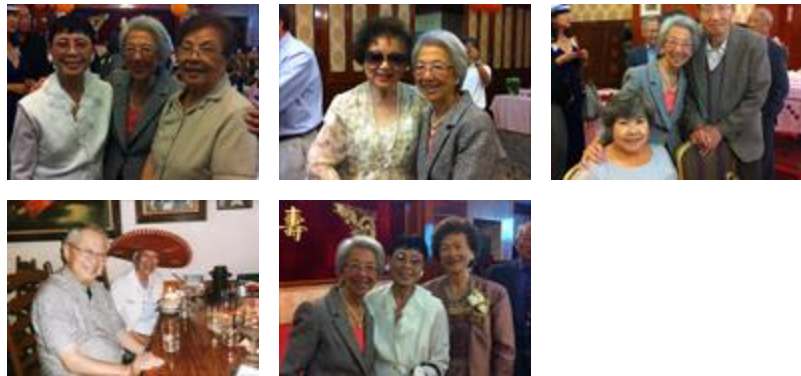
Reflecting on Memories - March 02, 2015 at 06:03 PM

“ 74 files added to the album Memories Album